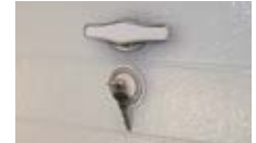
Outside keyed lock