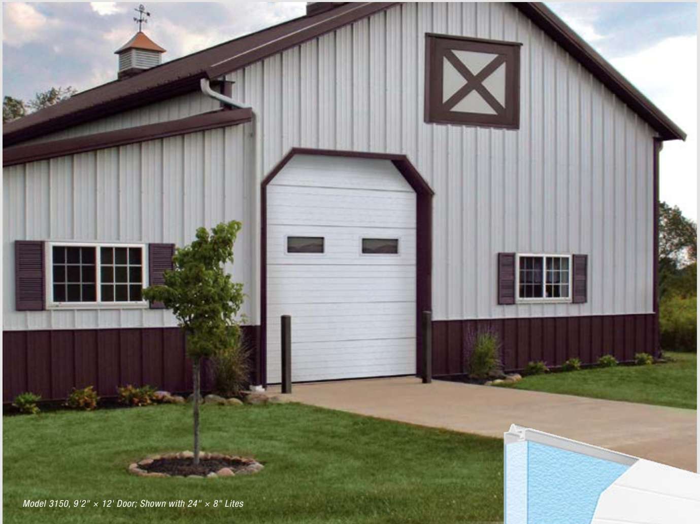
Model 3150, 9'2" x 12' Door; Shown with 24" x 8" Lites