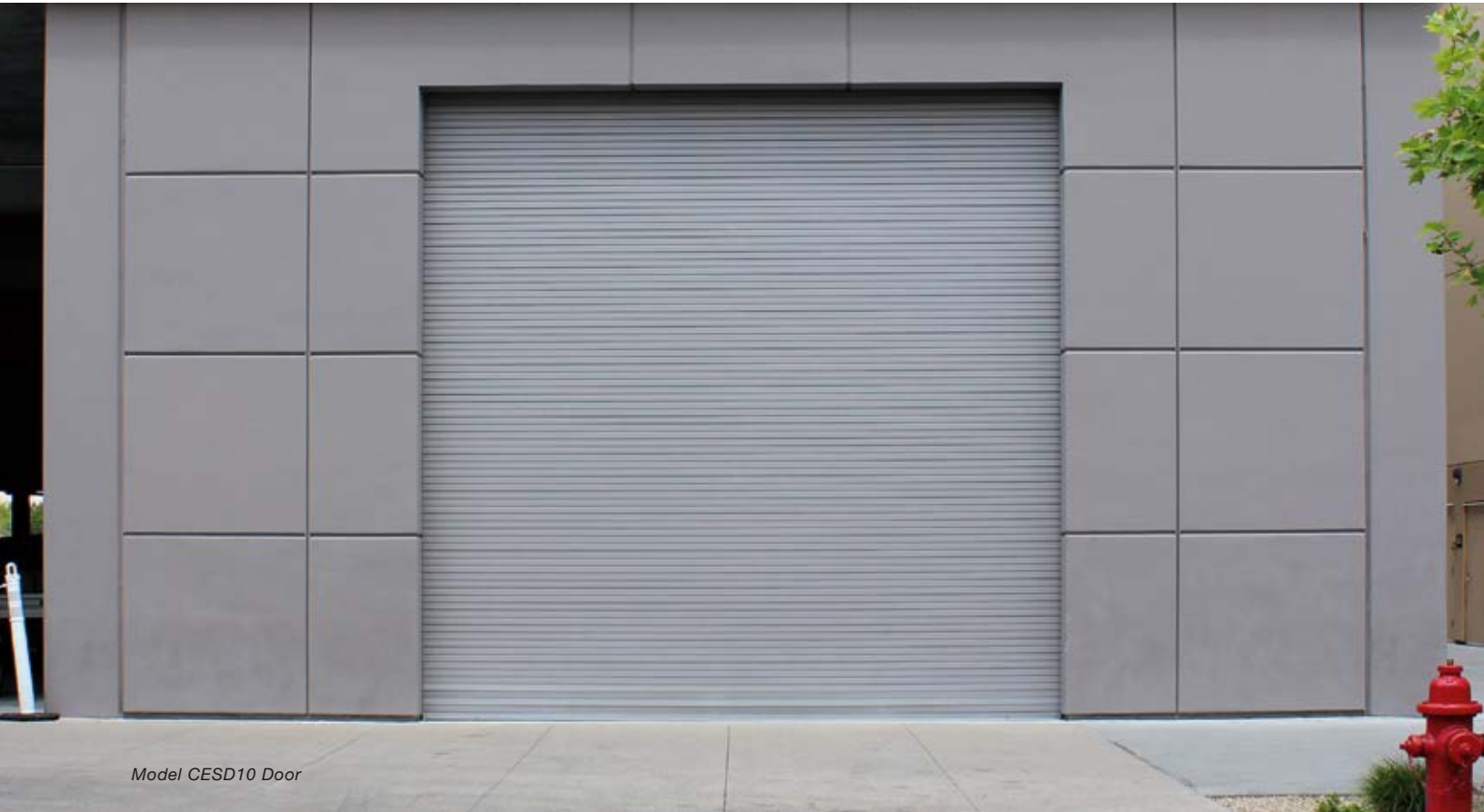
Model CESD10 Door